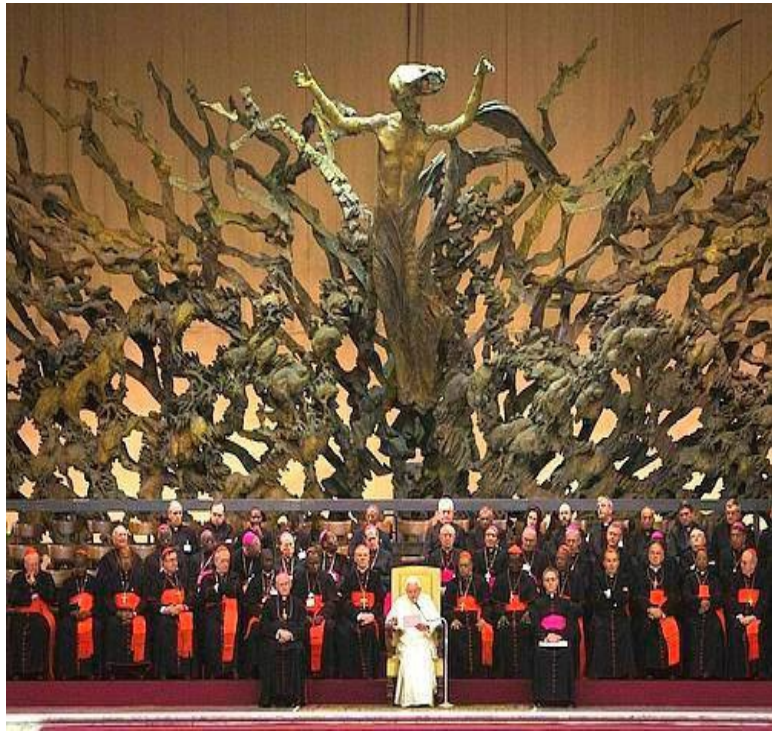
Speaking from the mouth of the snake in the Audience Hall

In the predicted doom of the Papacy there are thus two well-marked stages. There is, first, a gradual consumption; and there is, second, a sudden and terrible destruction. The "consumption," a slow and gradual process, is to be effected by the "spirit of His mouth," by which we understand the preaching of the Gospel. This consumption has been going on ever since the Bible was translated, and the Gospel began to be preached at the Reformation. Men have begun to see the errors of popery; its political props have been weakened, and in some instances struck from under it, and its hold generally on the nations of Christendom has been loosened; and thus the way has been prepared for the final stroke that will consummate its ruin.